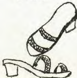
Sand clogs, made of wood and lacquered and lettered in Japanese characters. Straw sandals were worn also. Beach party - Sept. 12 Doherty State Park.

These fashions were in style from 1928 to 1931.