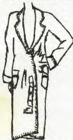
Linen cover-up beach coat. Came in terry cloth or indian head.

Not much room for fashions again this month, but here are a couple of beach fashions.